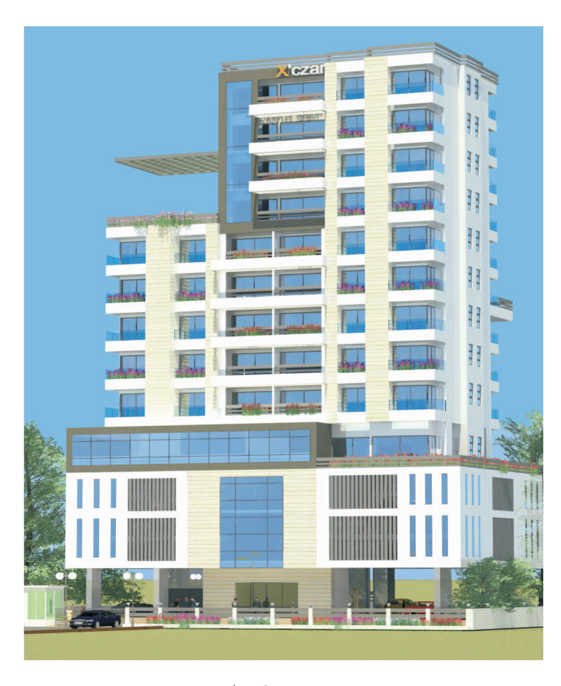
Under Construction Artist Impression *