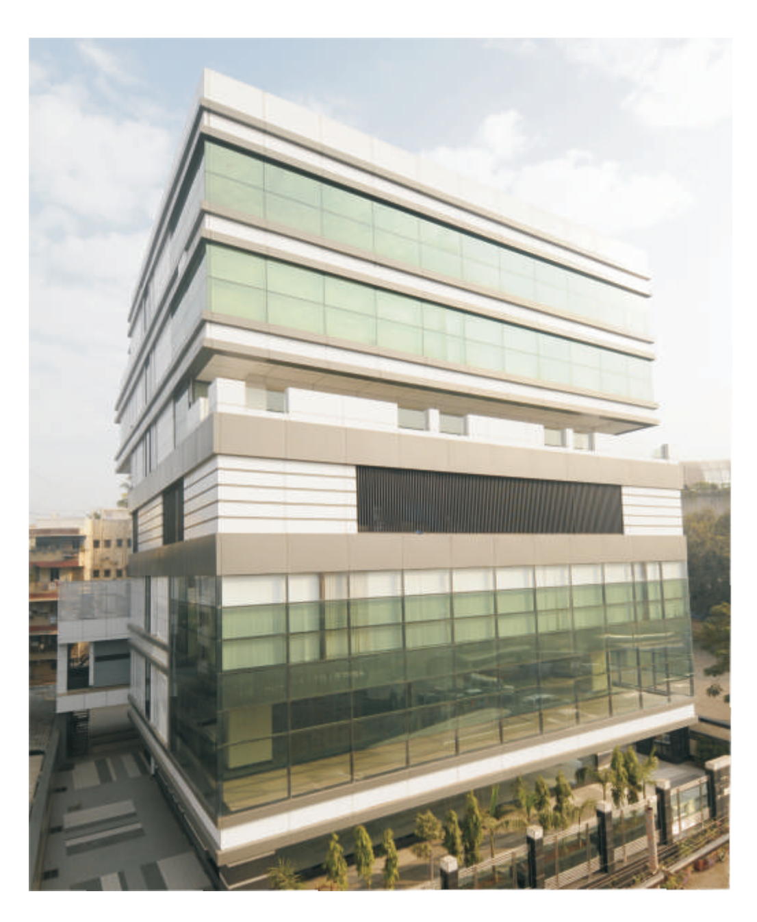
Completed Commercial Project